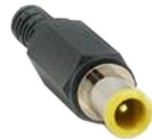
EJ1/2/3/4/5 (EIAJ RC-5320A type connectors)