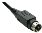
YL3 Type (KPPX-3P)