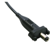
Inquire for custom design

For a comprehensive list of options, click here