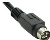
YL4 Type (KPPX-4P)